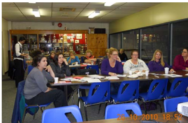
Island General Meeting Tuesday, October 26th, 2010