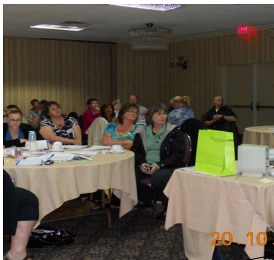
Sudbury General Meeting Wednesday, October 20th, 2010