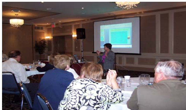
Members taking part in the Retirement workshop.